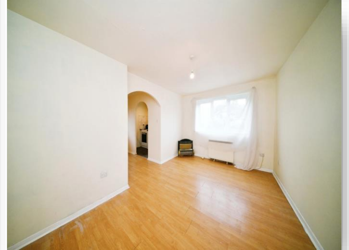
Parrotts Field, Hoddesdon EN11 0QX