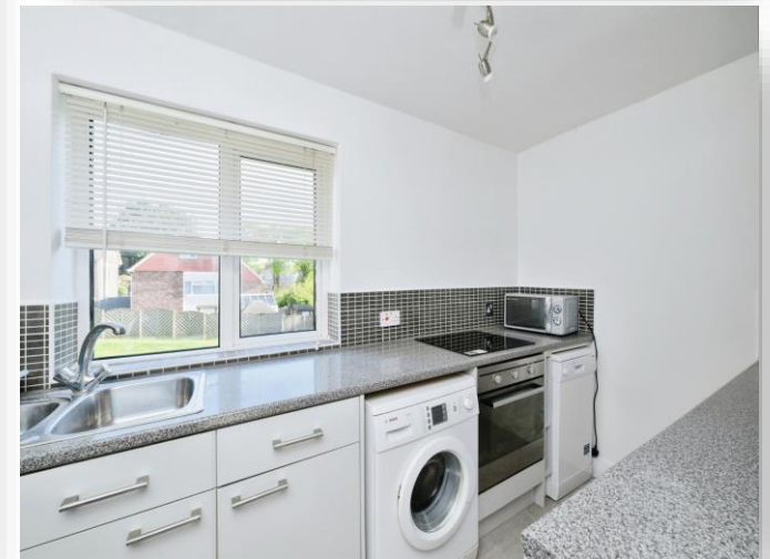
Hillside, Hoddesdon EN11 8RW