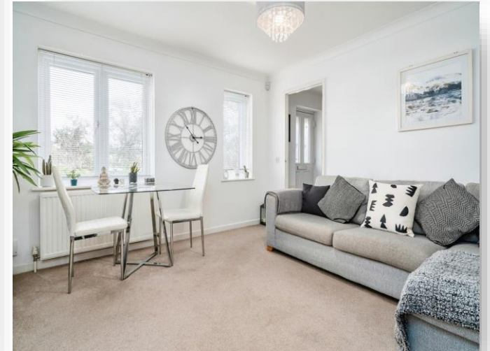
Slade End, Theydon Bois Epping CM16 7EP