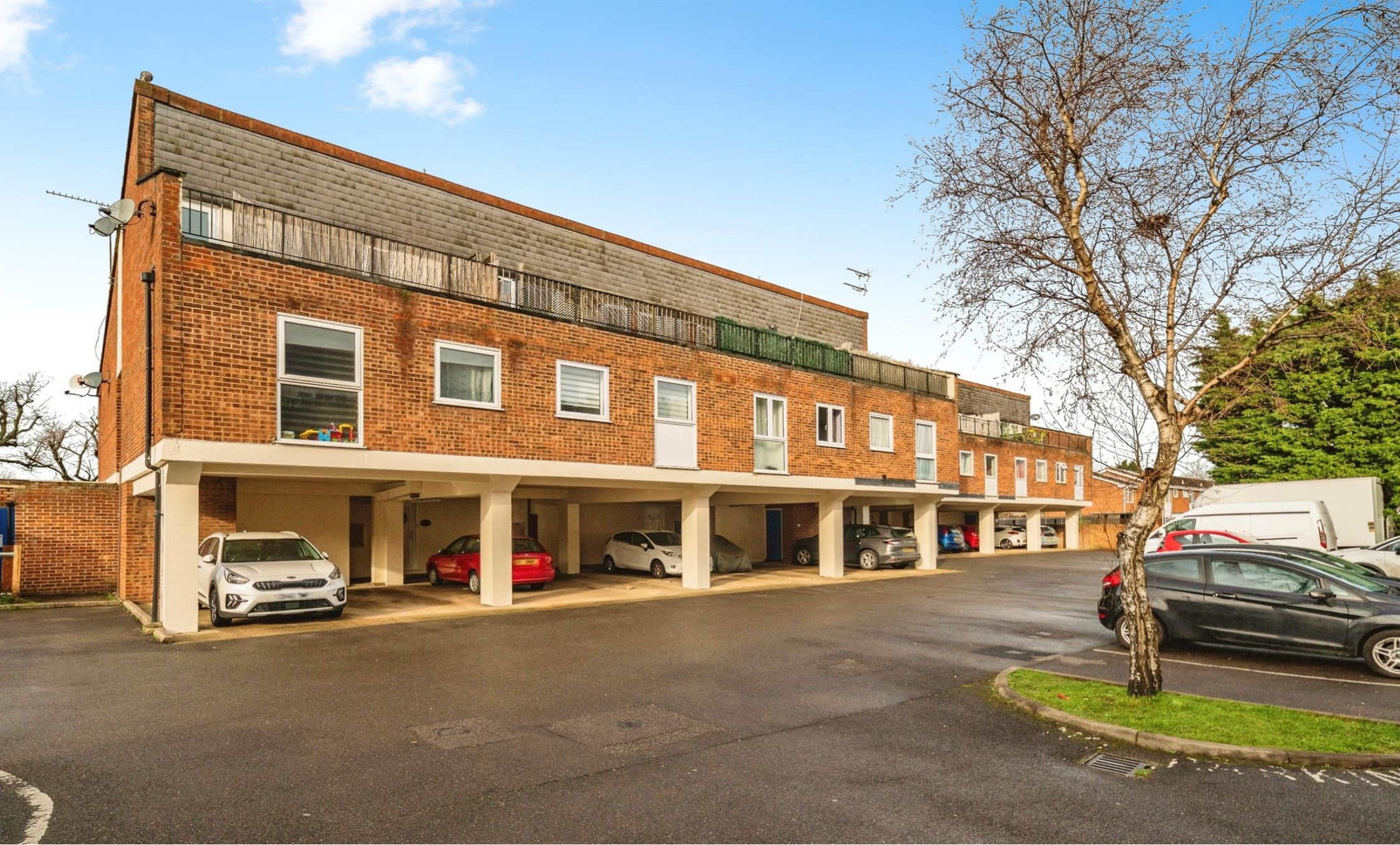
Shakespeare Court Chaucer Way, Hoddesdon EN11 9QS