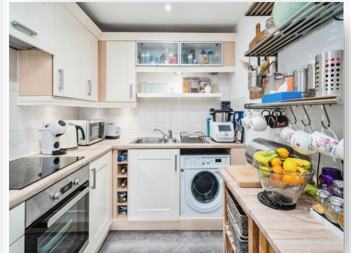
Clarence Lodge Taverners Way, Hoddesdon EN11 8TH