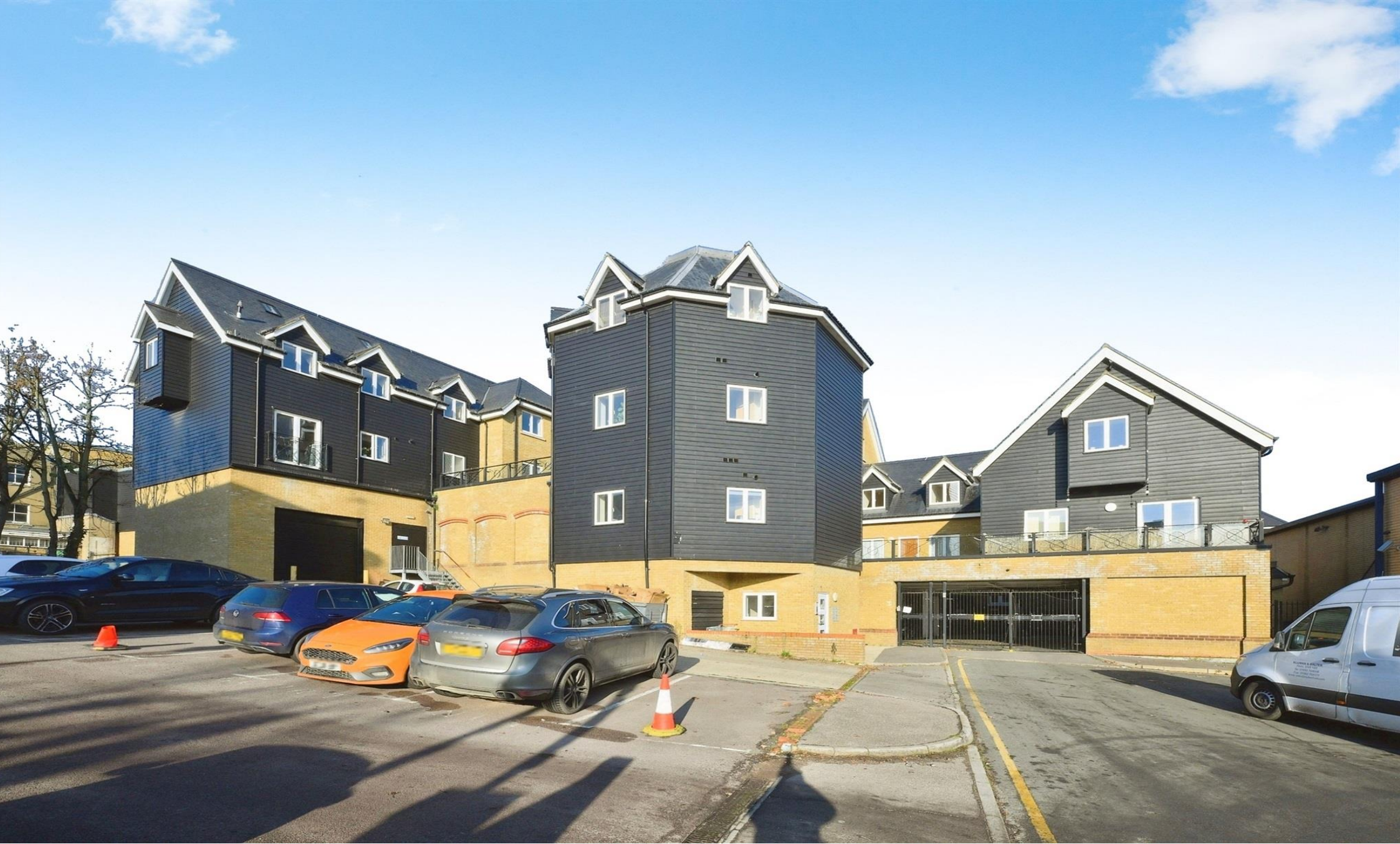
Market Court High Street, Hoddesdon EN11 8HD