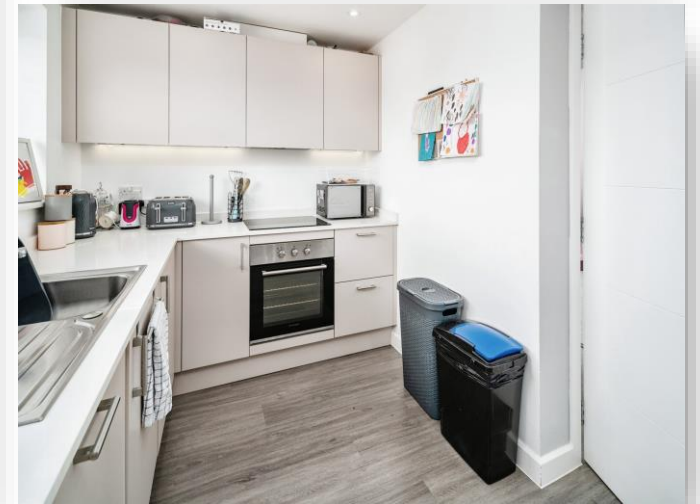
Lampits, Hoddesdon EN11 8EA