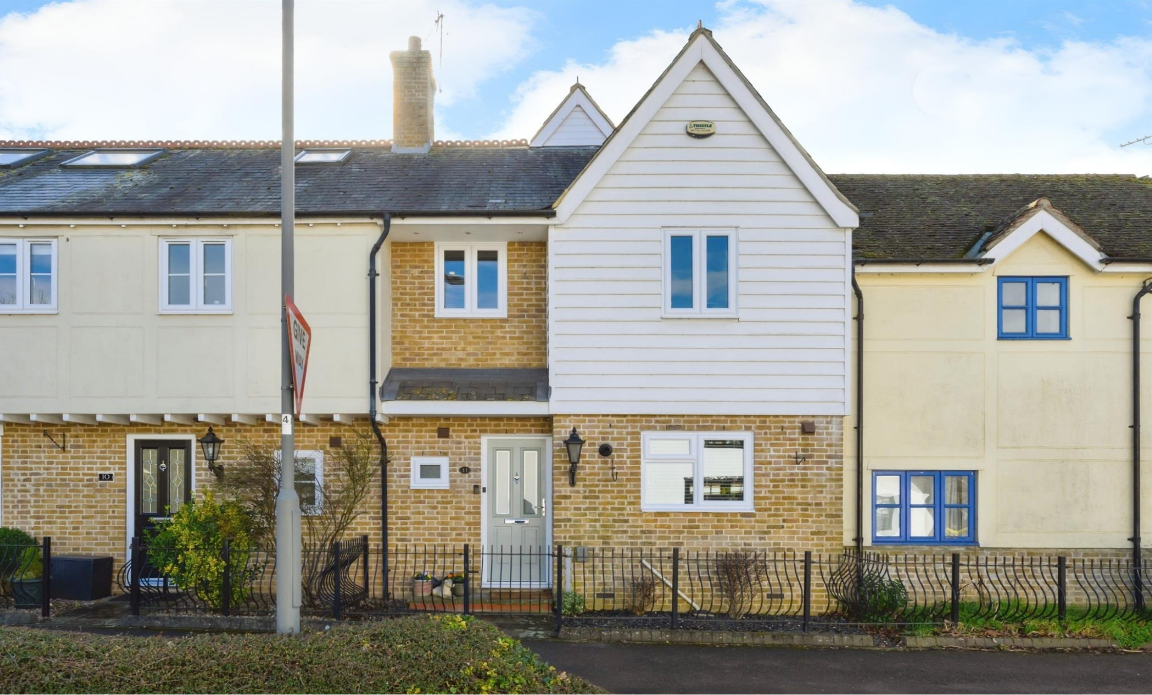
Long Meadow, Watton At Stone, Hertford, SG14 3YP