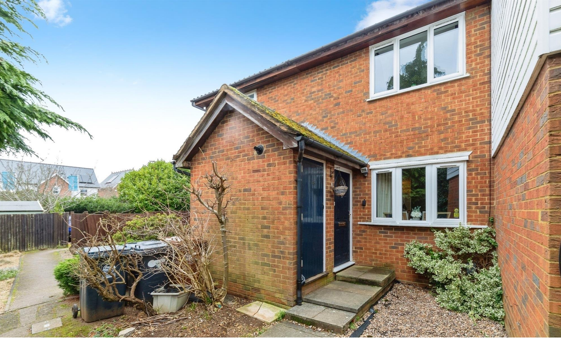
Turpins Close, Hertford, SG14 2EH