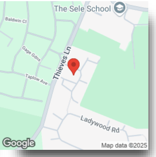
Please note the marker reflects the postcode not the actual property