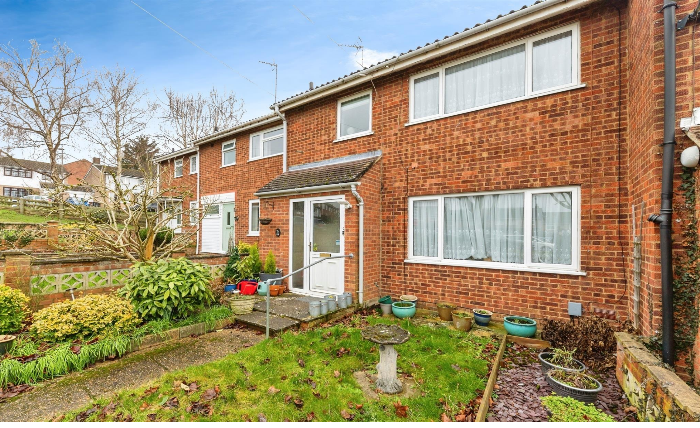
Great Innings South, Watton At Stone, Hertford, SG14 3TF