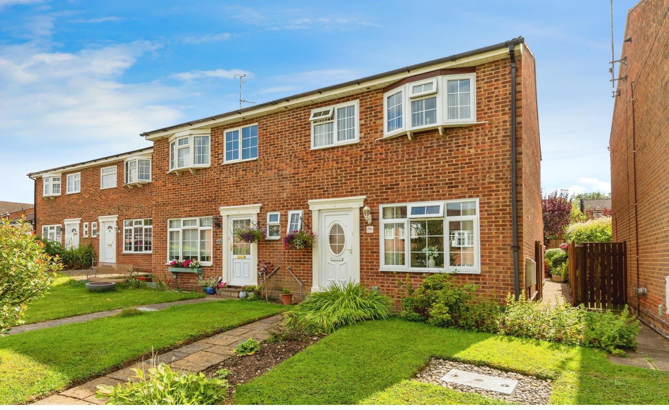
Heathgate, Hertford Heath, Hertford, SG13 7PJ