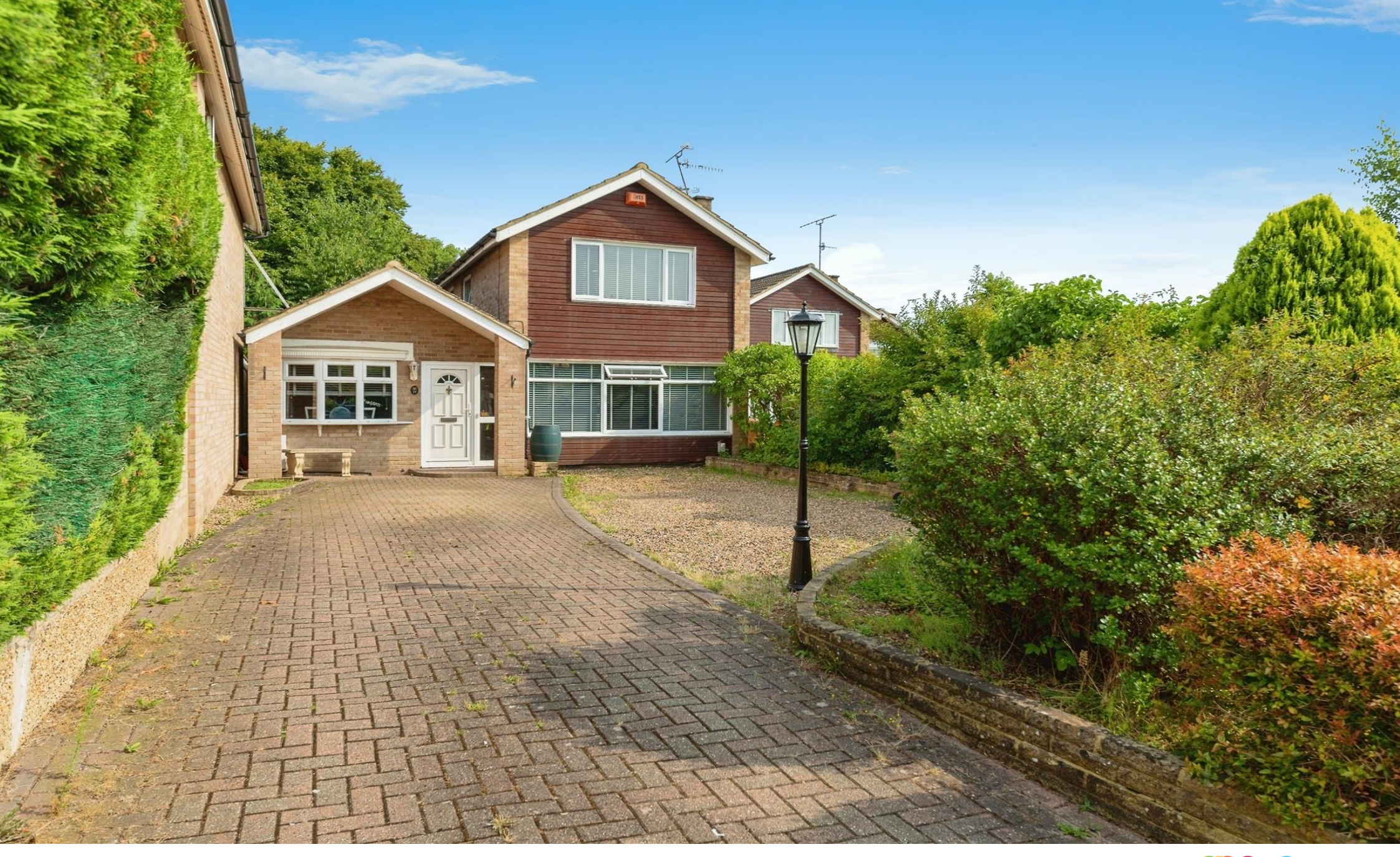
The Ridgeway, Hertford, SG14 2JE