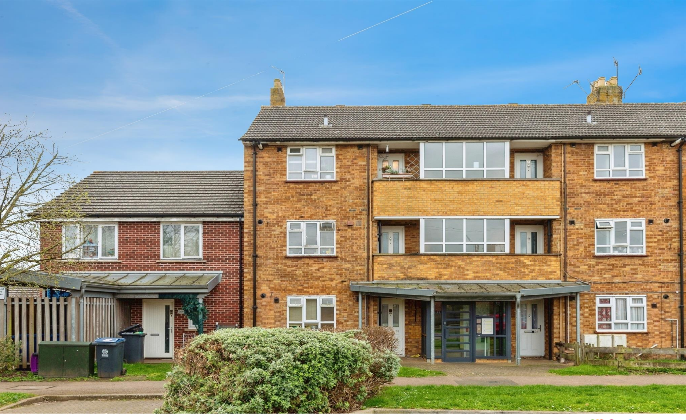
Farm Close, HERTFORD, SG14 2DP