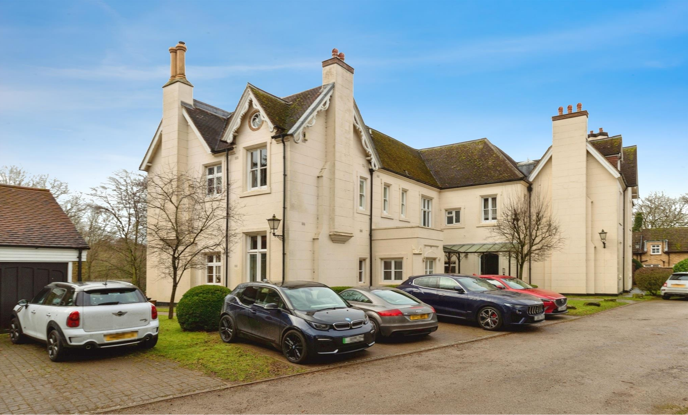
Watton House, Watton At Stone, Hertford, SG14 3NZ