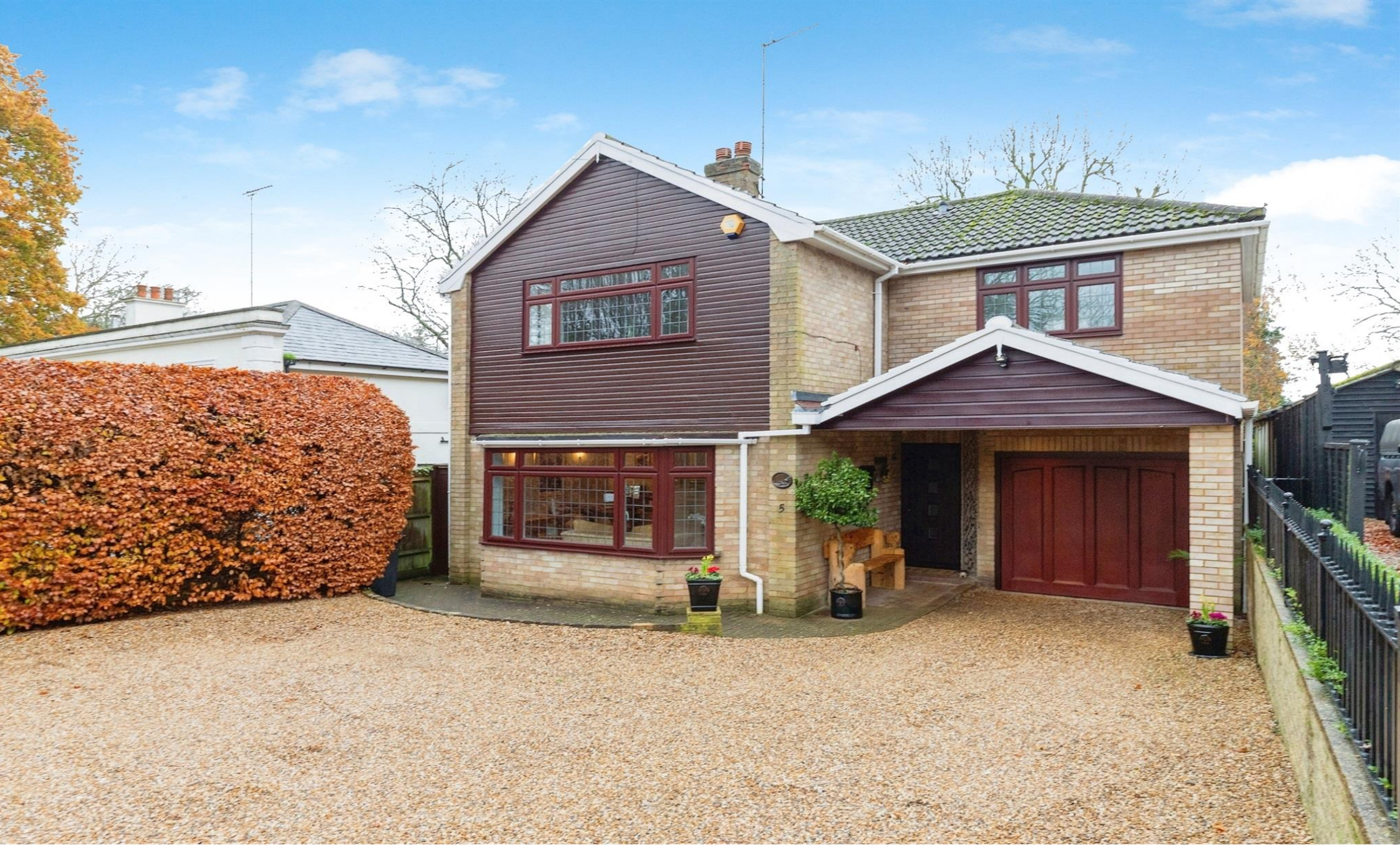
Newgate Street Village, Hertford, SG13 8RA