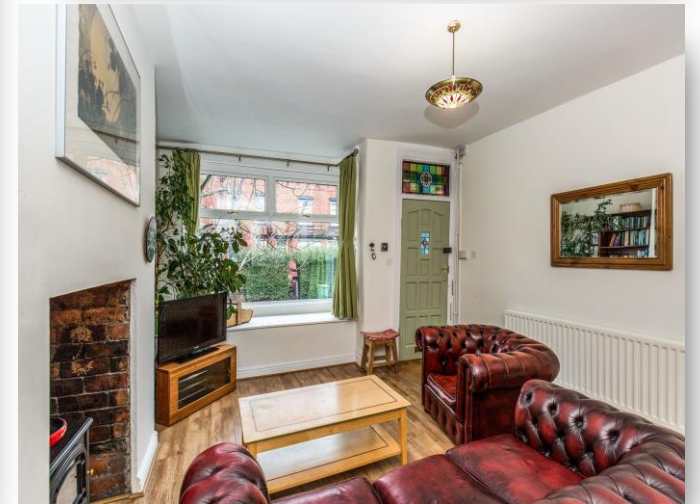
Beechwood View, LEEDS LS4 2LP