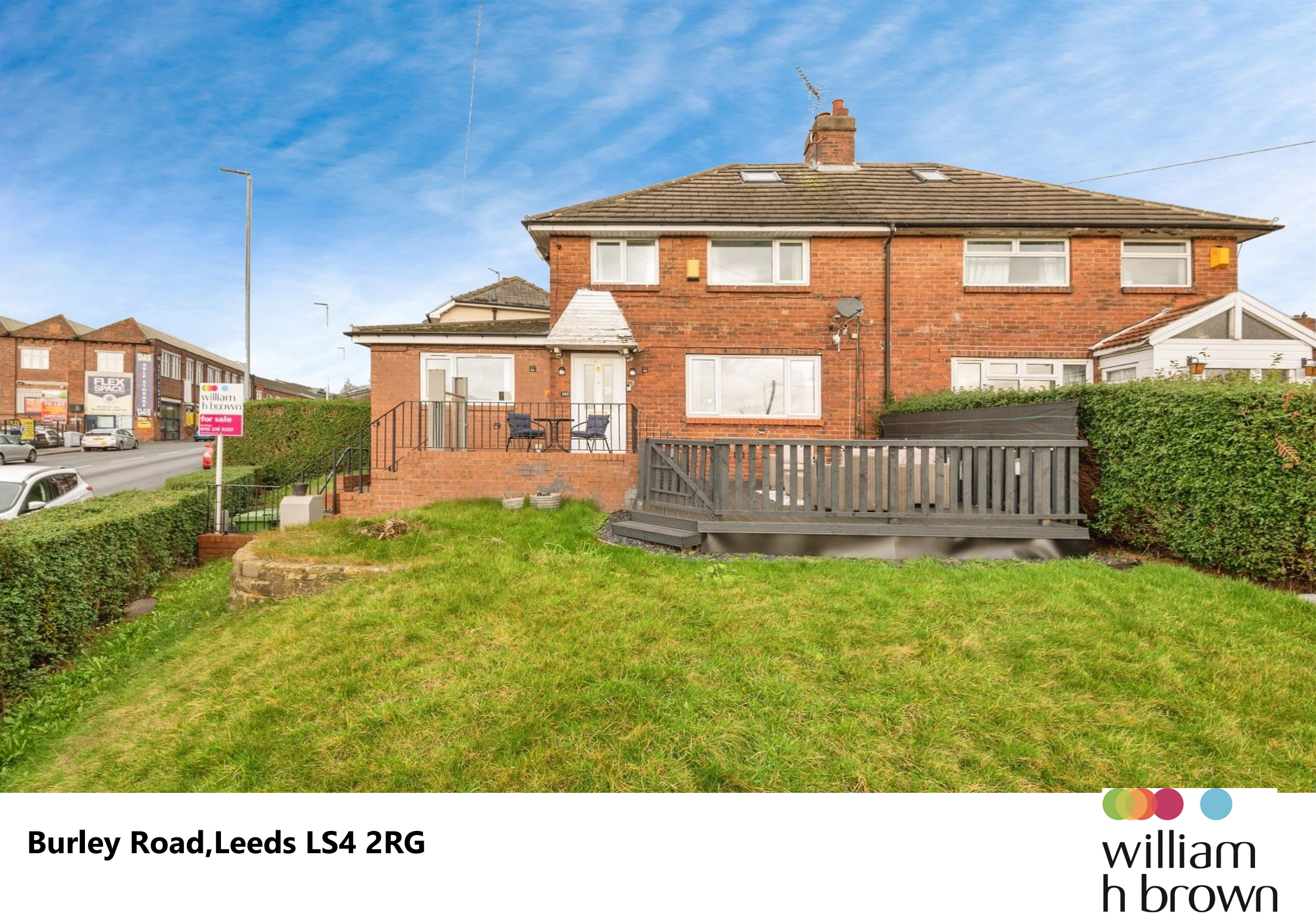
Burley Road, Leeds LS4 2RG