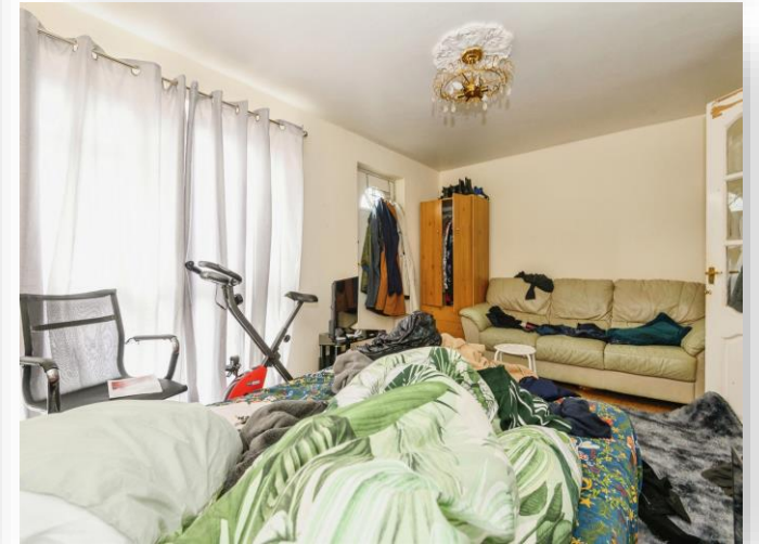
Kendal Lane, Leeds LS3 1AS