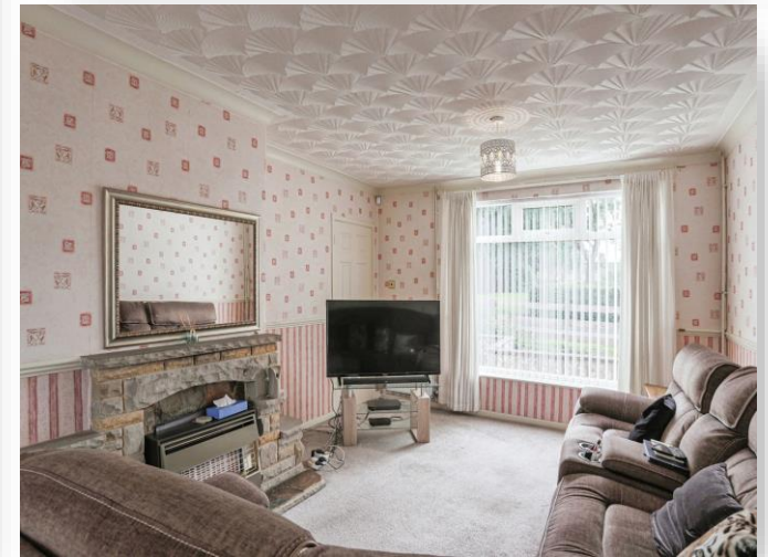
Old Oak Drive, LEEDS LS16 5HA