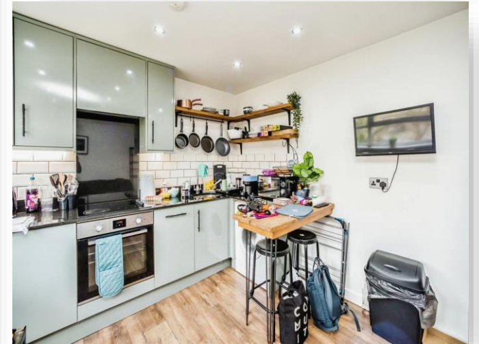
Kirkstall Gate, Commercial Road, Leeds LS5 3AD