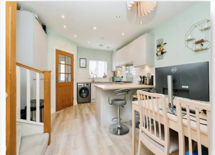
Eden Court, Leeds LS4 2BF