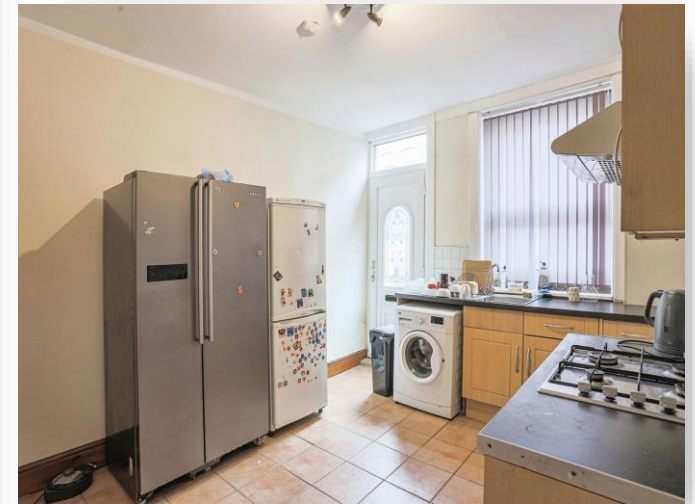
Burley Lodge Terrace, Leeds LS6 1QA