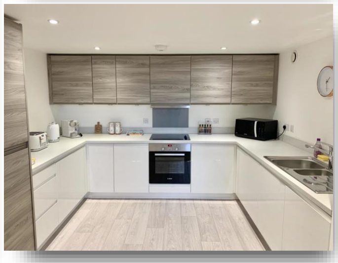
The Old School House, Victoria Gardens, Hyde Park, Leeds LS6 1FH