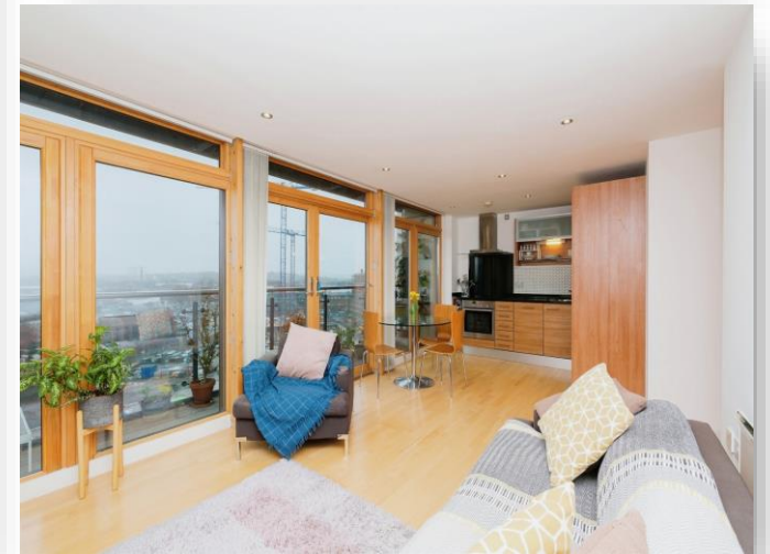
Clarence House The Boulevard, Leeds LS10 1LG