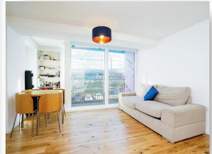
The Avenue, Leeds LS9 8FT