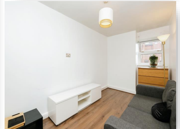
Kelso Heights, Belle Vue Road, Leeds LS3 1HN