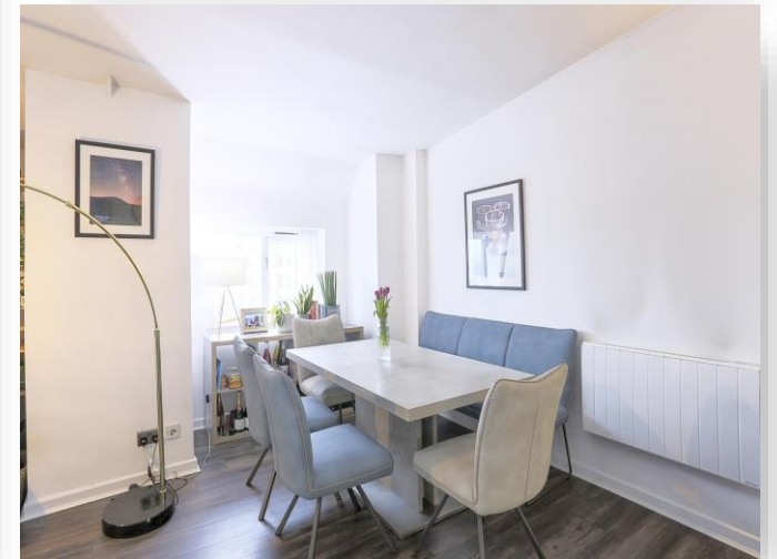
Merchants House North Street, LEEDS LS2 7PN