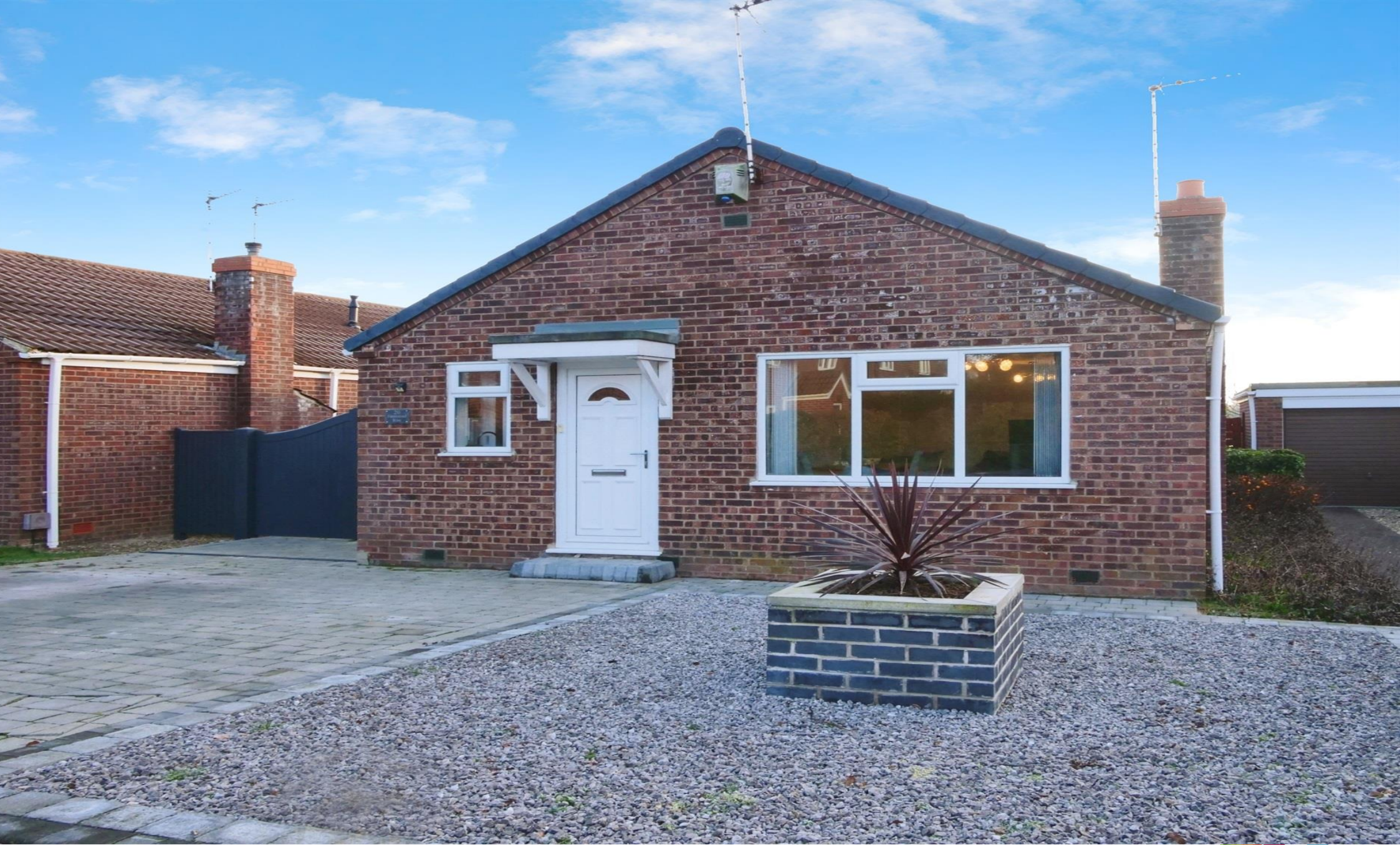
Farmstead Rise, Haxby York YO32 3LL