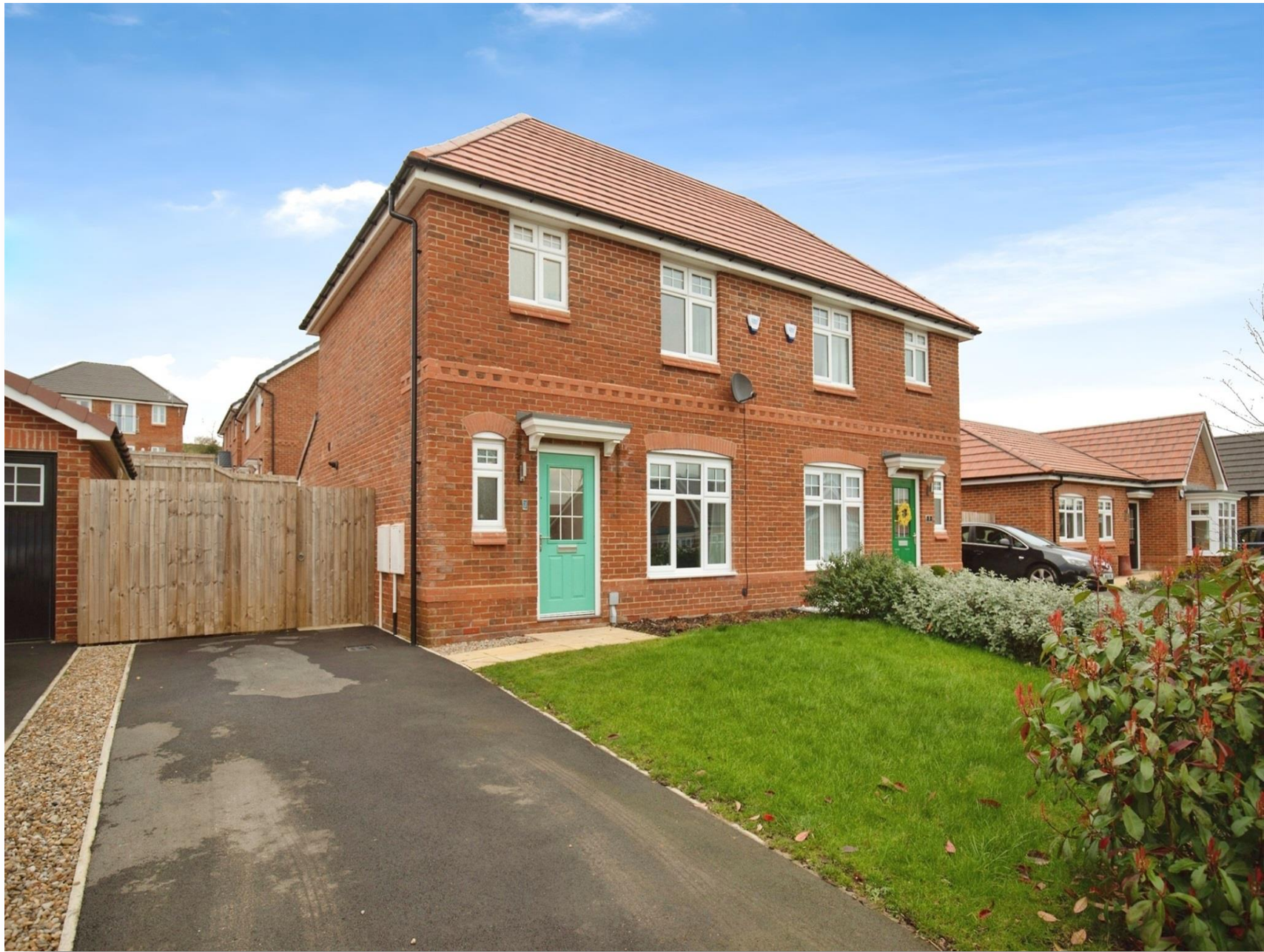
Howkeld Close, Kirkbymoorside York YO62 6FN