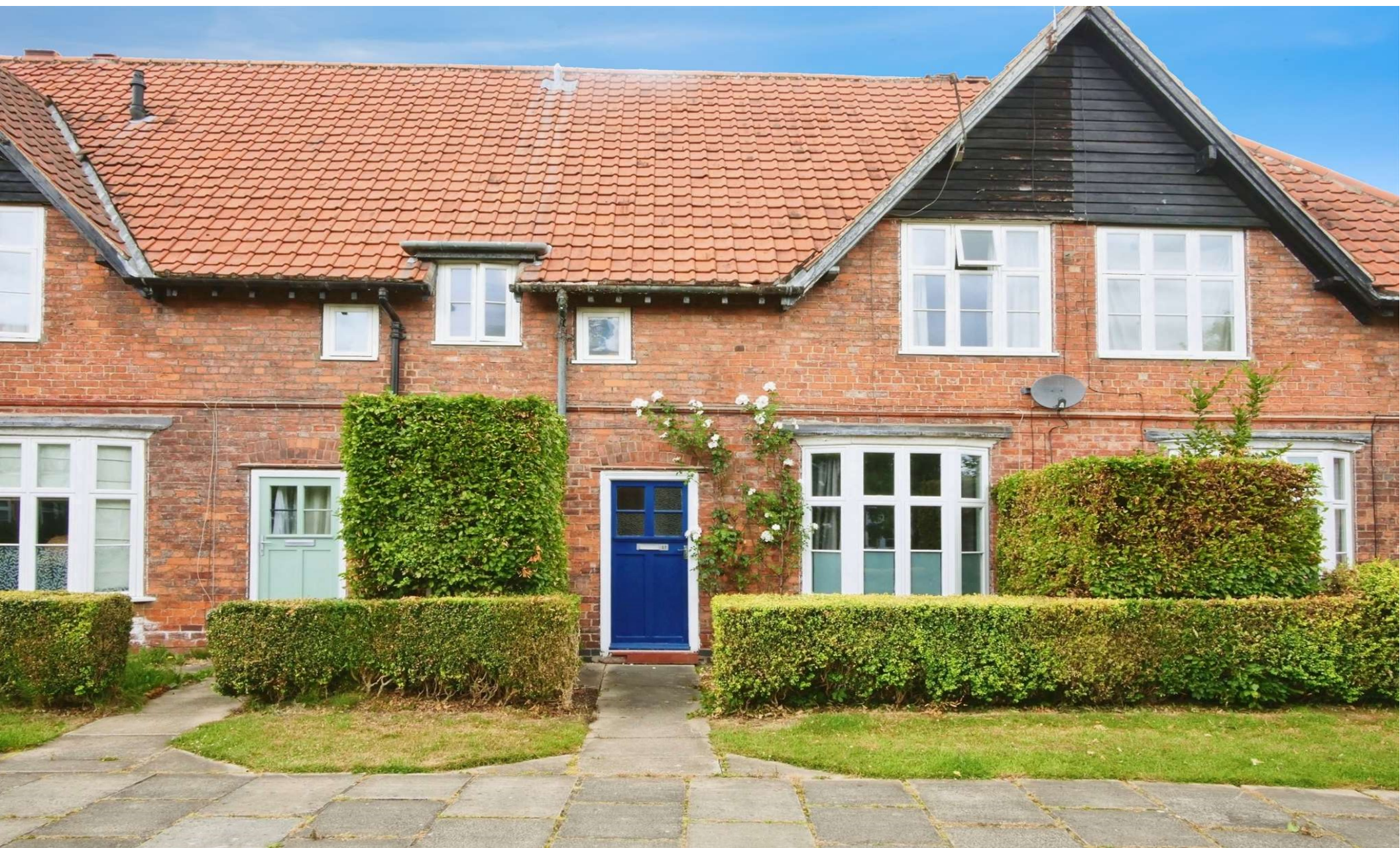
Chestnut Grove, New Earswick YORK YO32 4BU