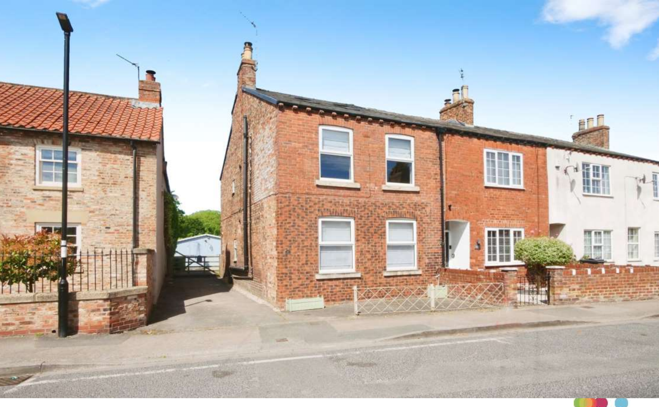
The Village, Strensall York YO32 5XR