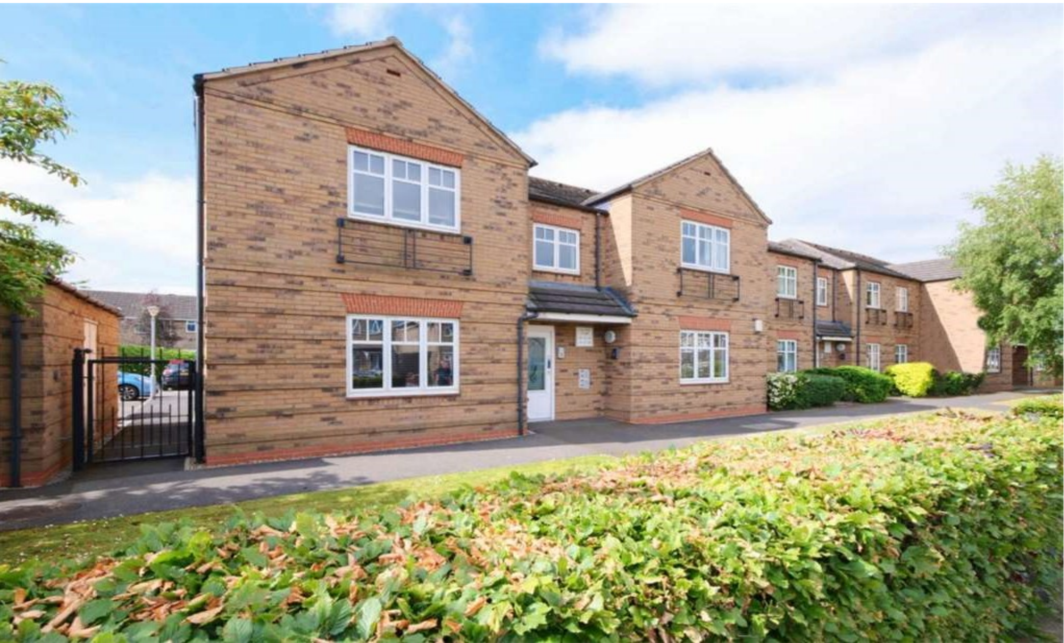
Oak Tree Court, Haxby York YO32 2WS