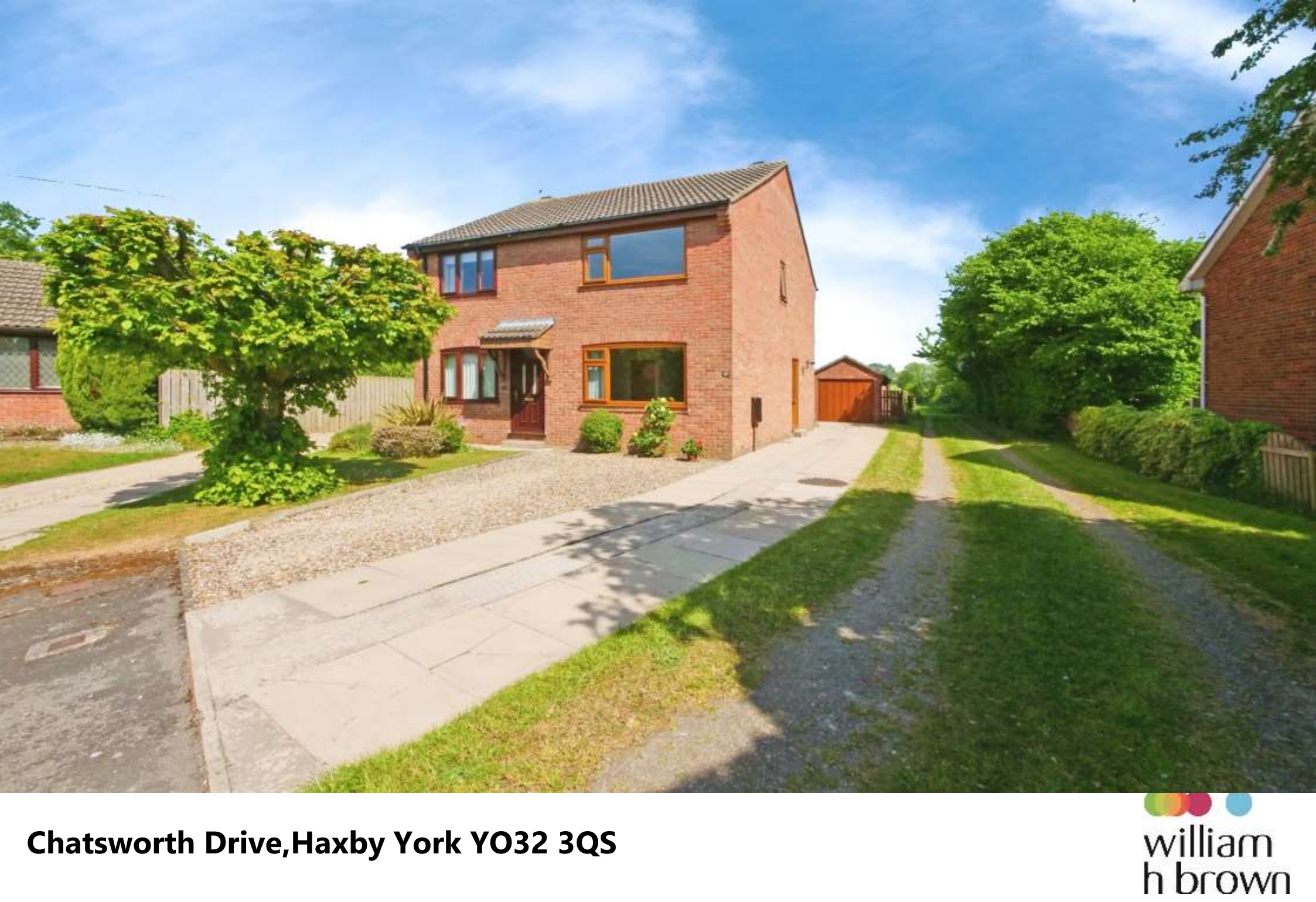
Chatsworth Drive, Haxby York YO32 3QS