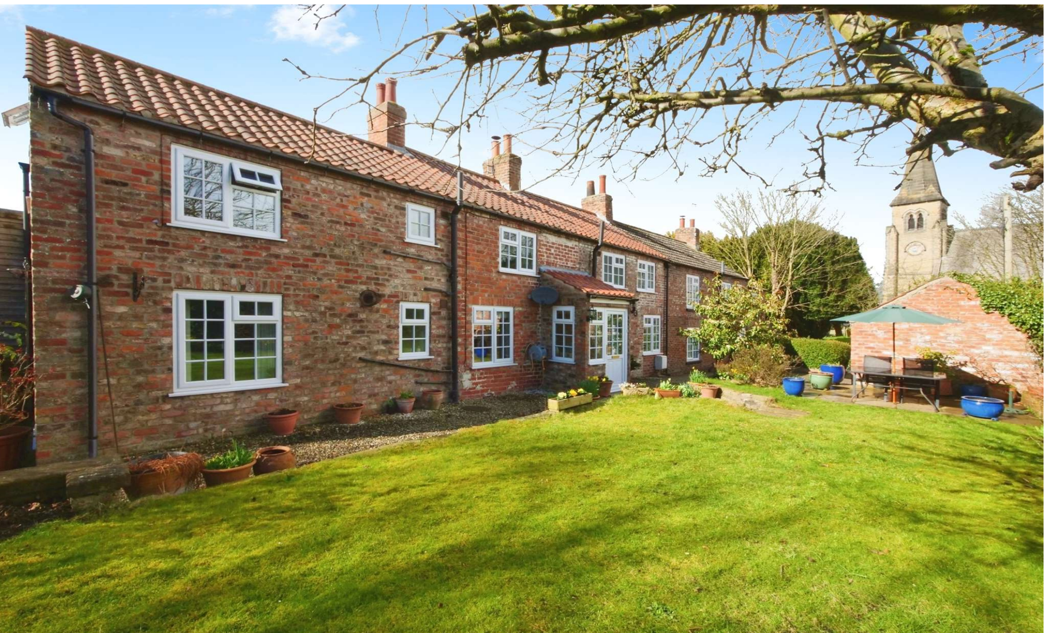
Church Lane, Strensall York YO32 5XU