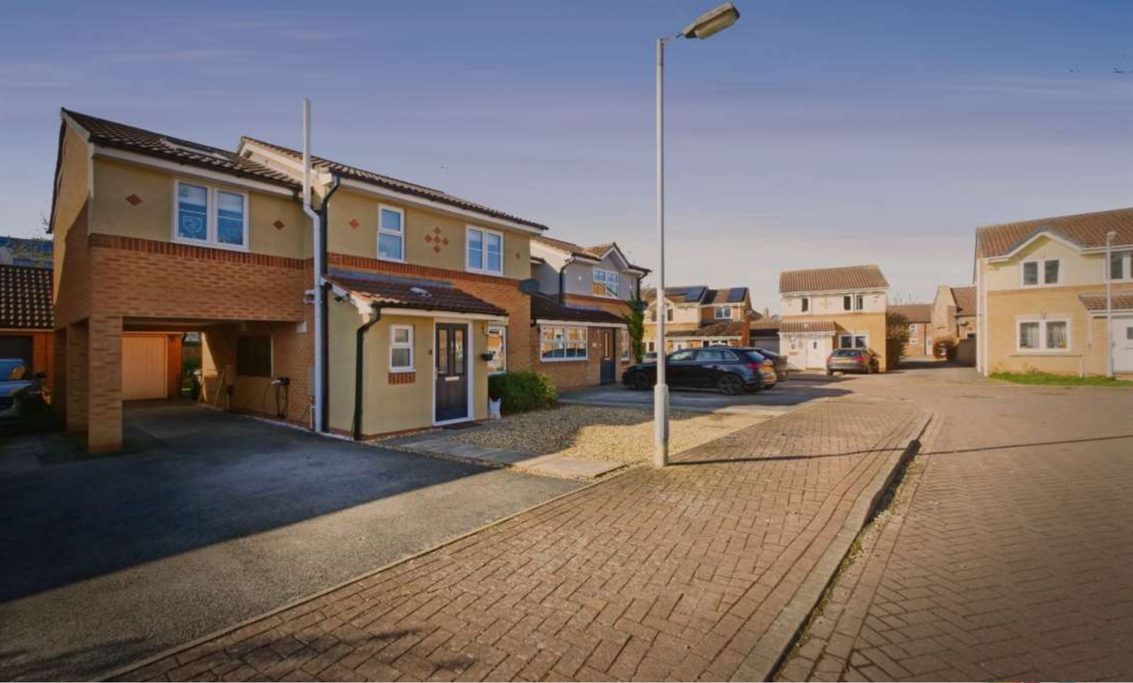
Hazelnut Grove, YORK YO30 6RA