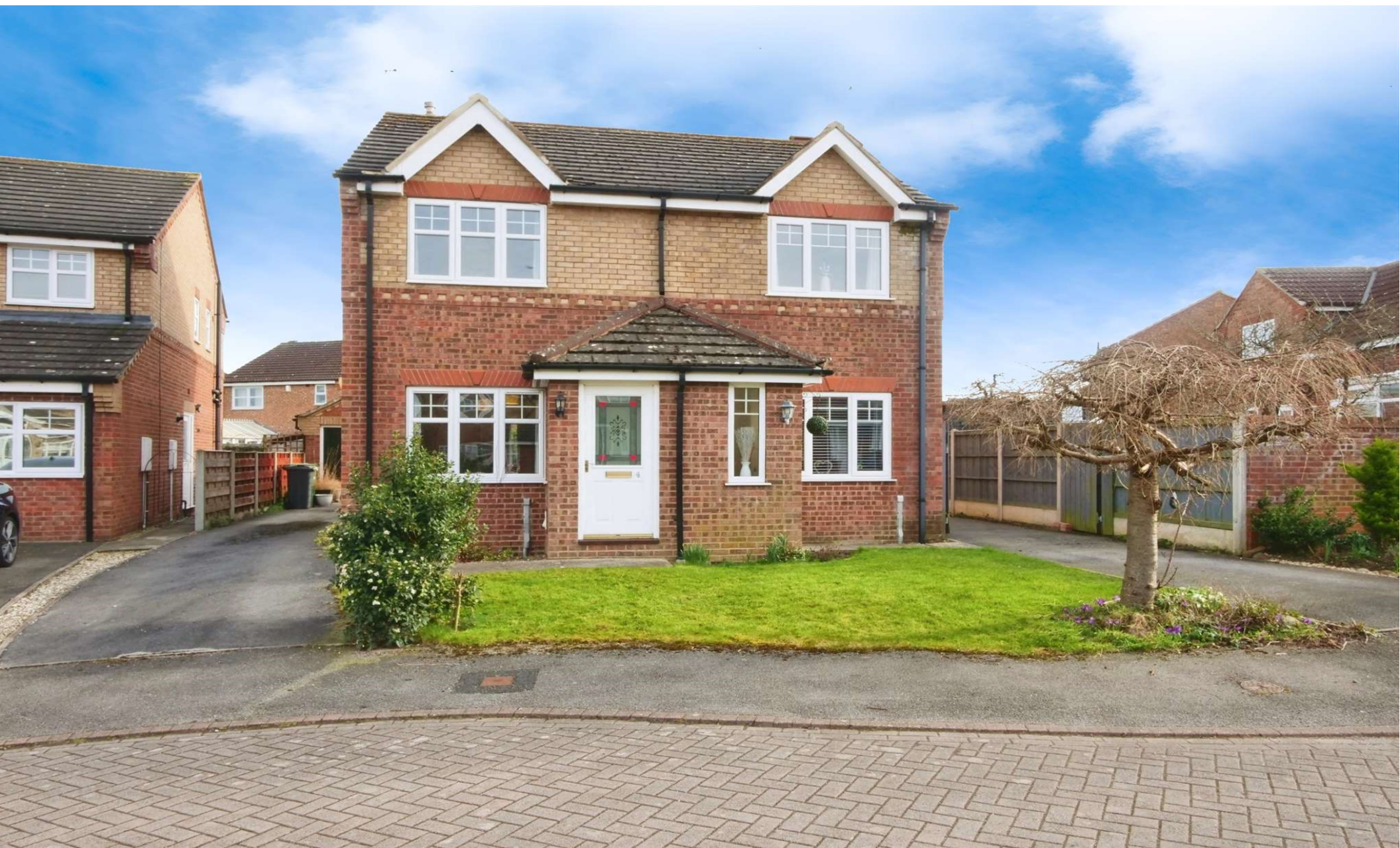
Pulley Close, Strensall YORK YO32 5ZS