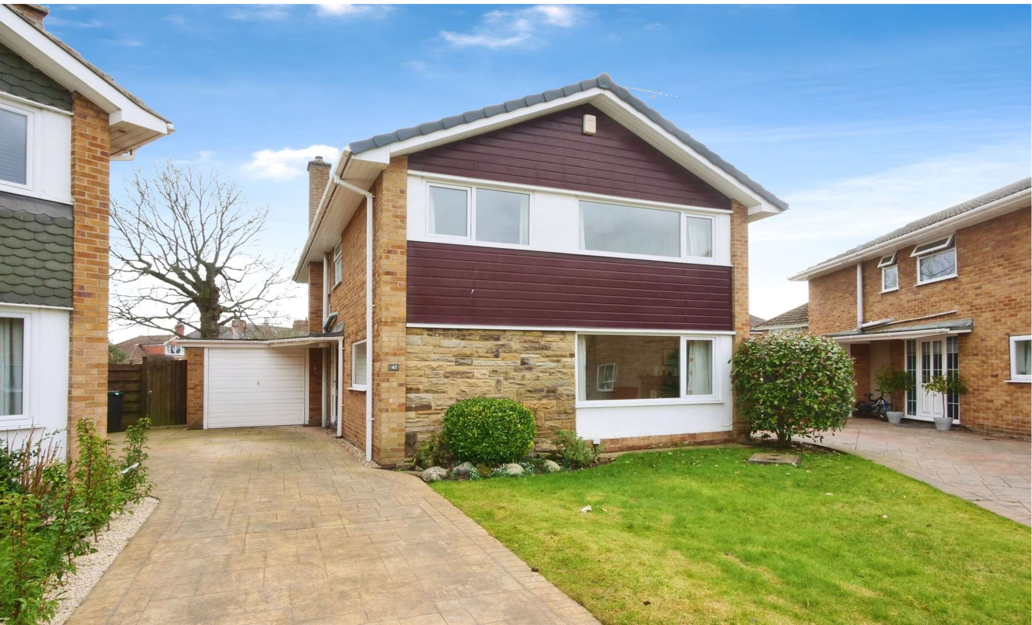
Old Orchard, Haxby York YO32 3DS