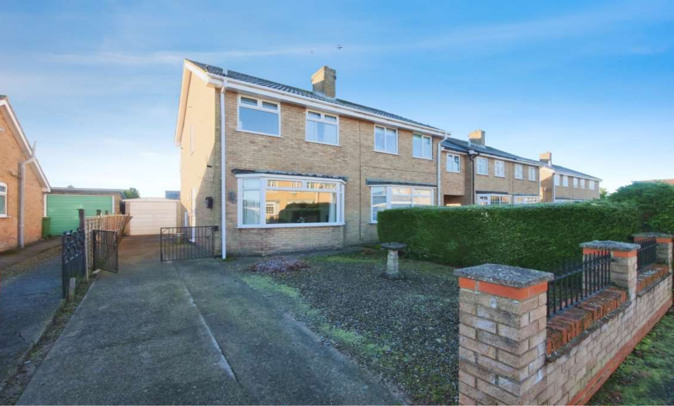
Churchfield Drive, Wigginton York YO32 2FL