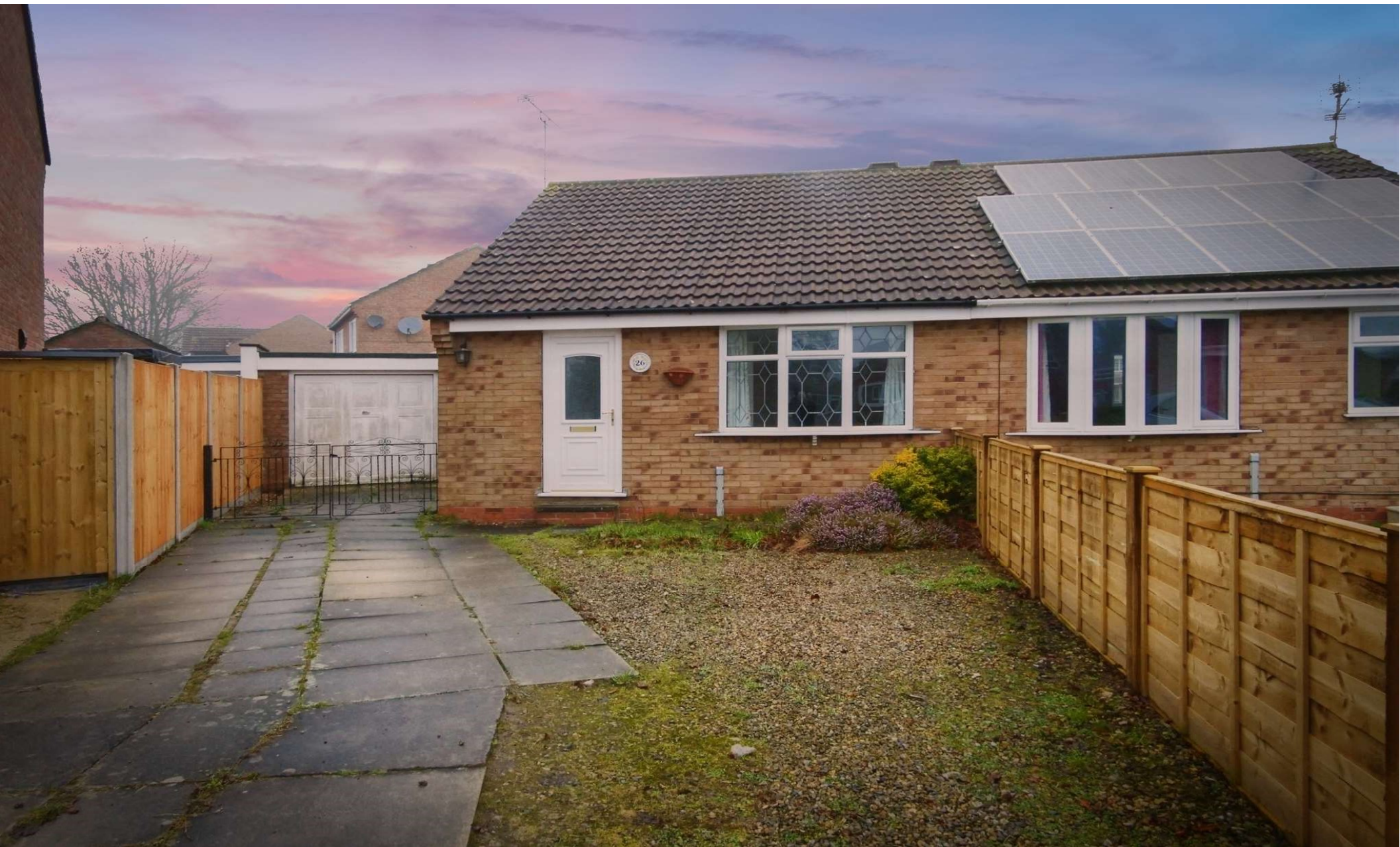
Lockey Croft, Wigginton YORK YO32 2FP