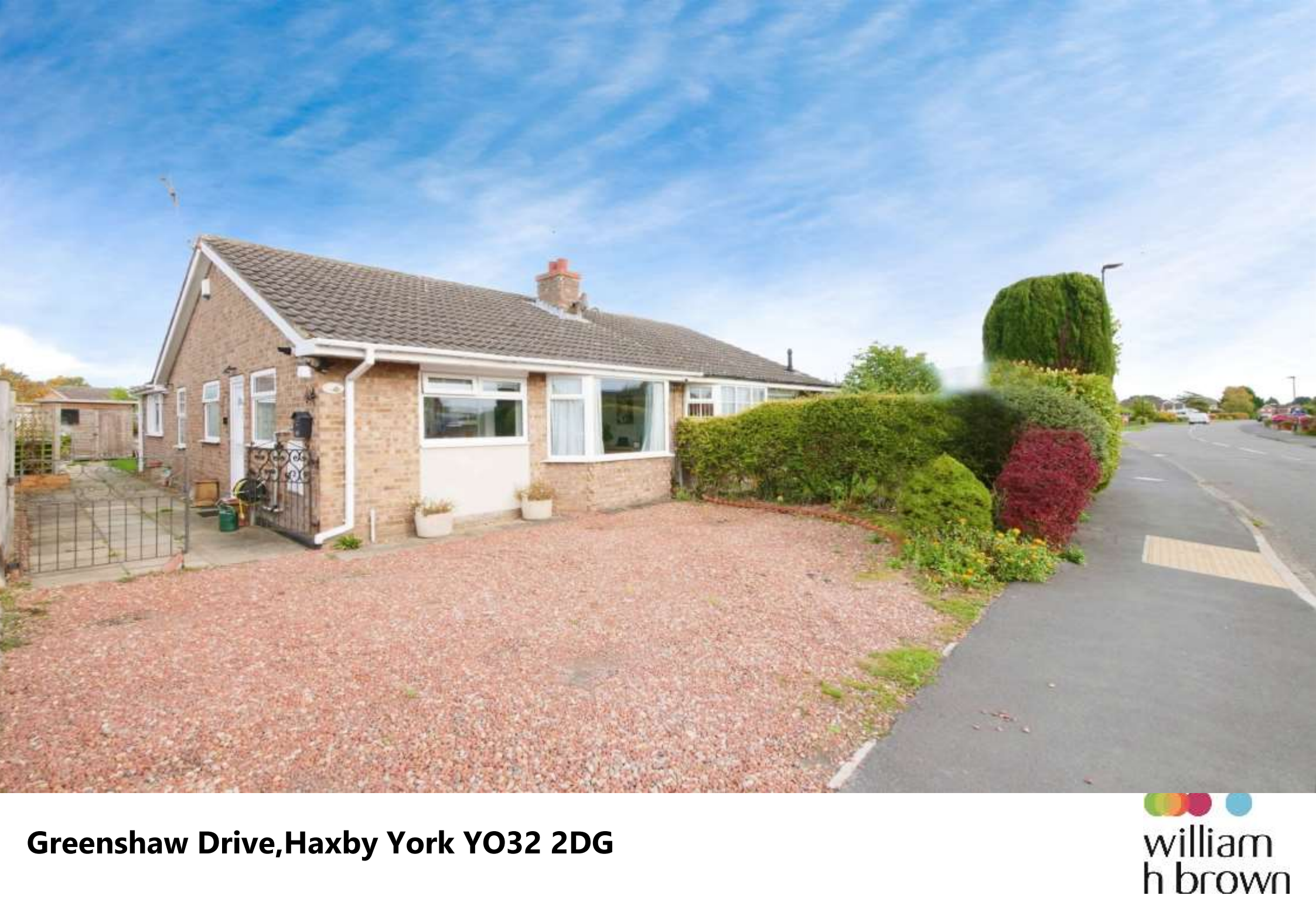
Greenshaw Drive, Haxby York YO32 2DG