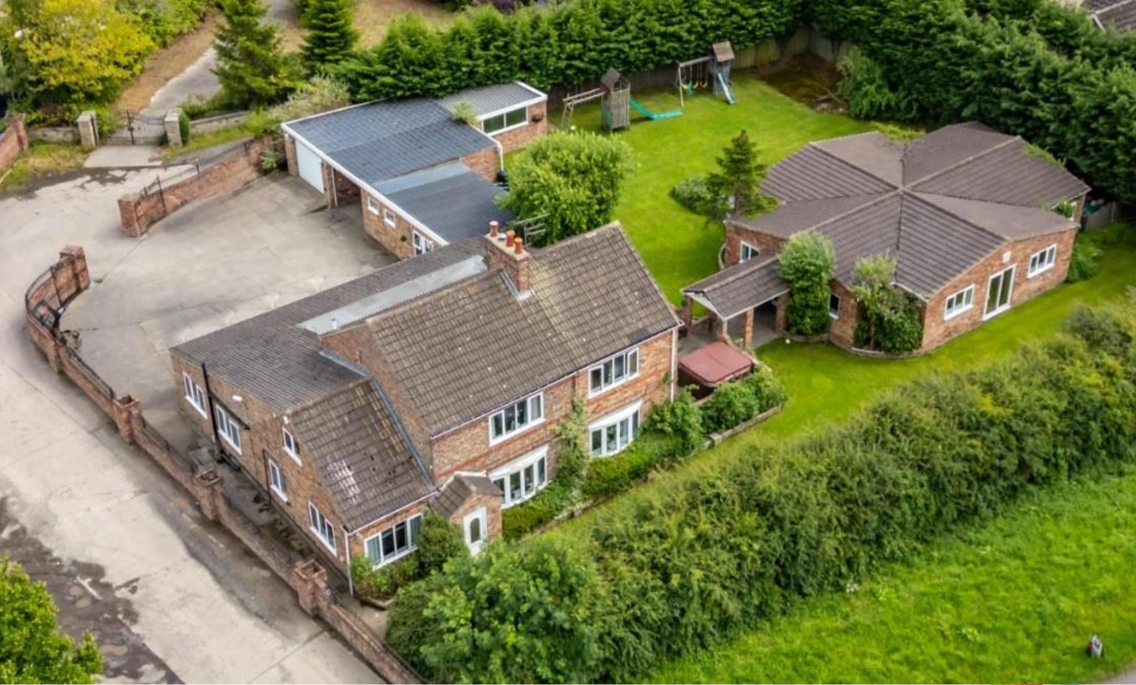
The Gardens Malton Road, York YO32 9TN