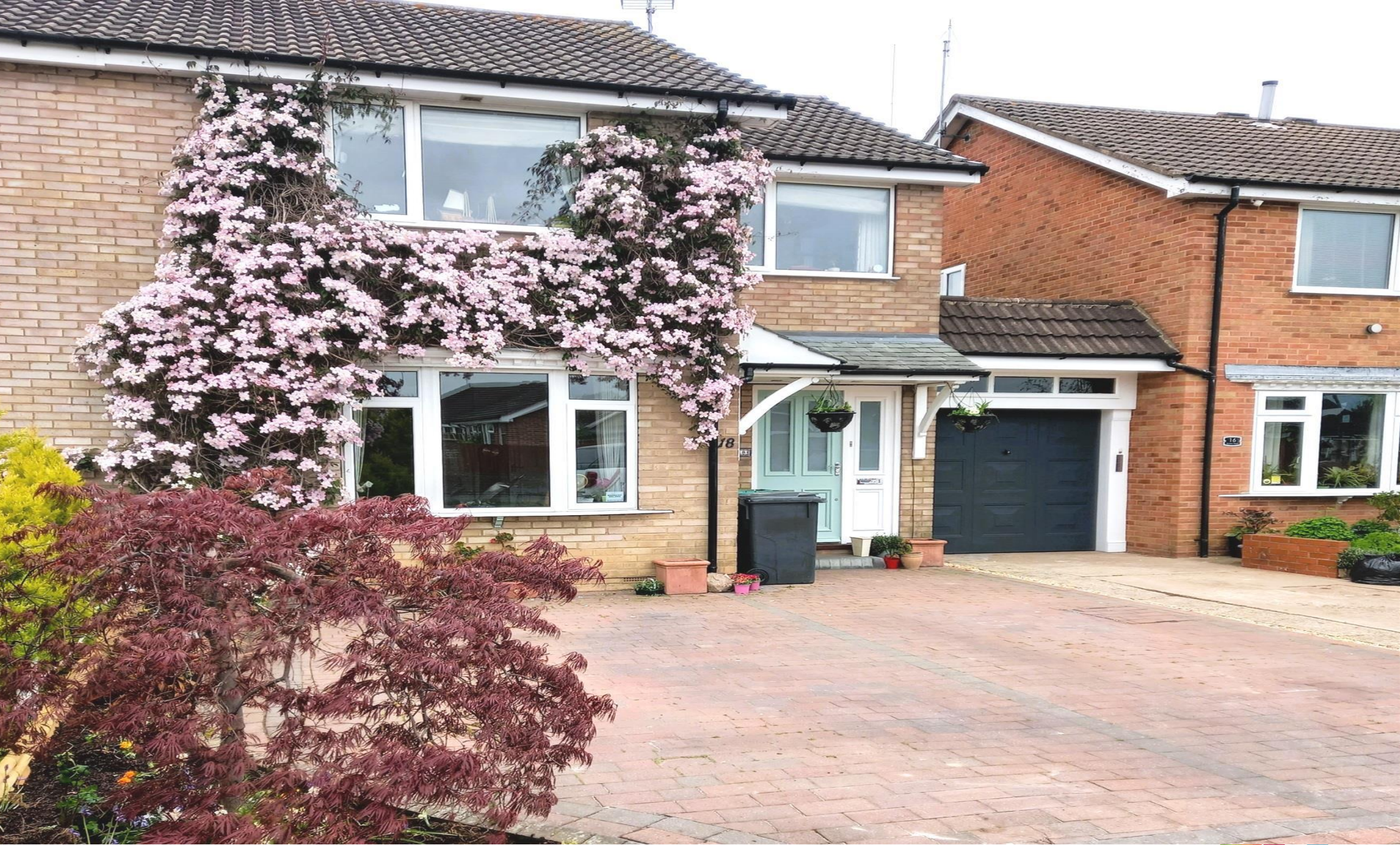
Barley View, Wigginton York YO32 2TY