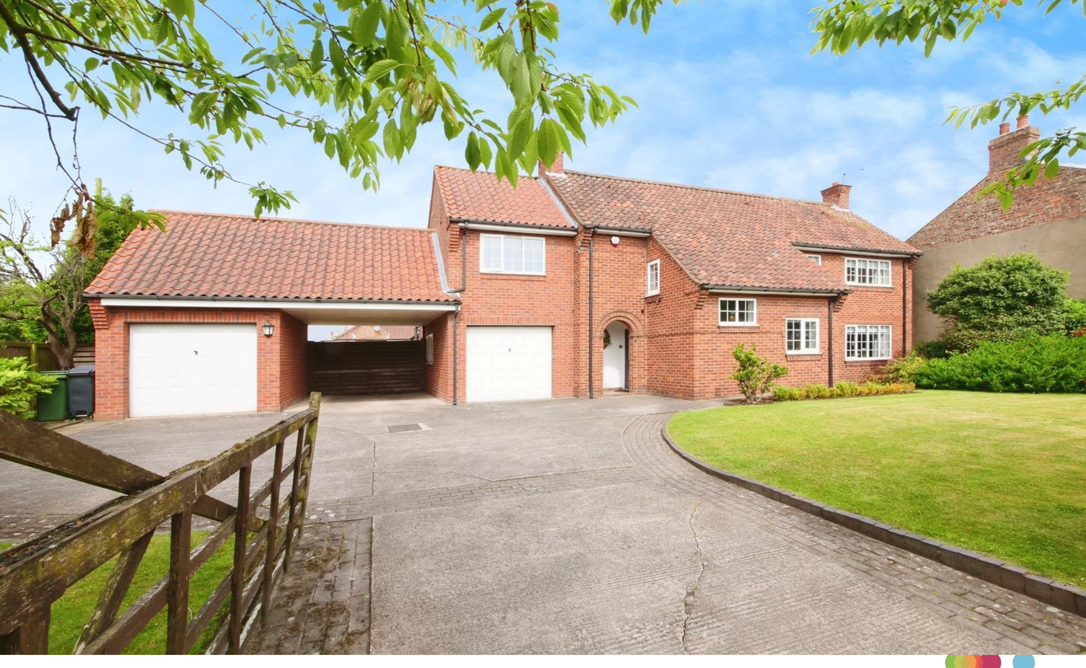
Strensall Road, Huntington YORK YO32 9RF