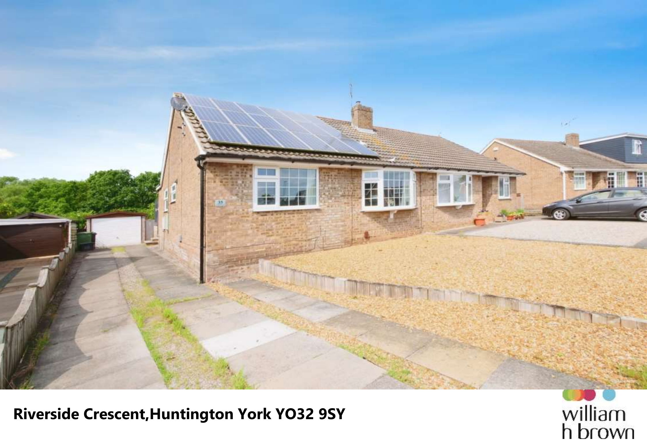
Riverside Crescent, Huntington York YO32 9SY