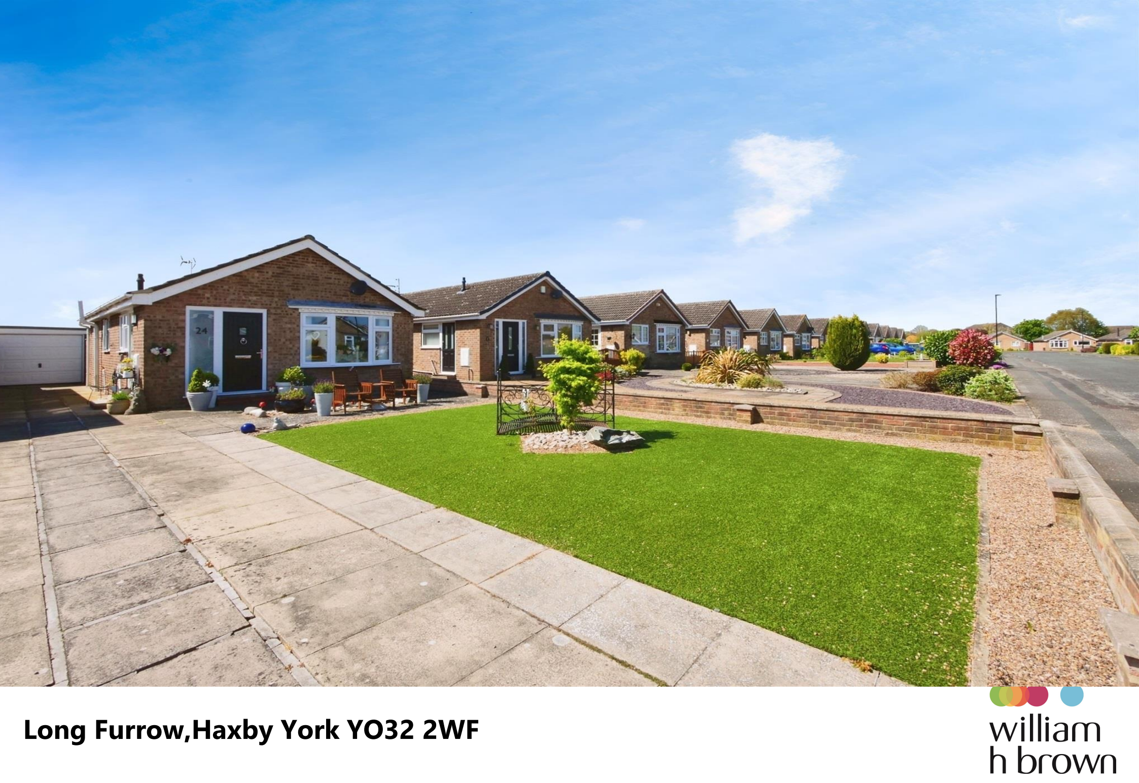
Long Furrow, Haxby York YO32 2WF