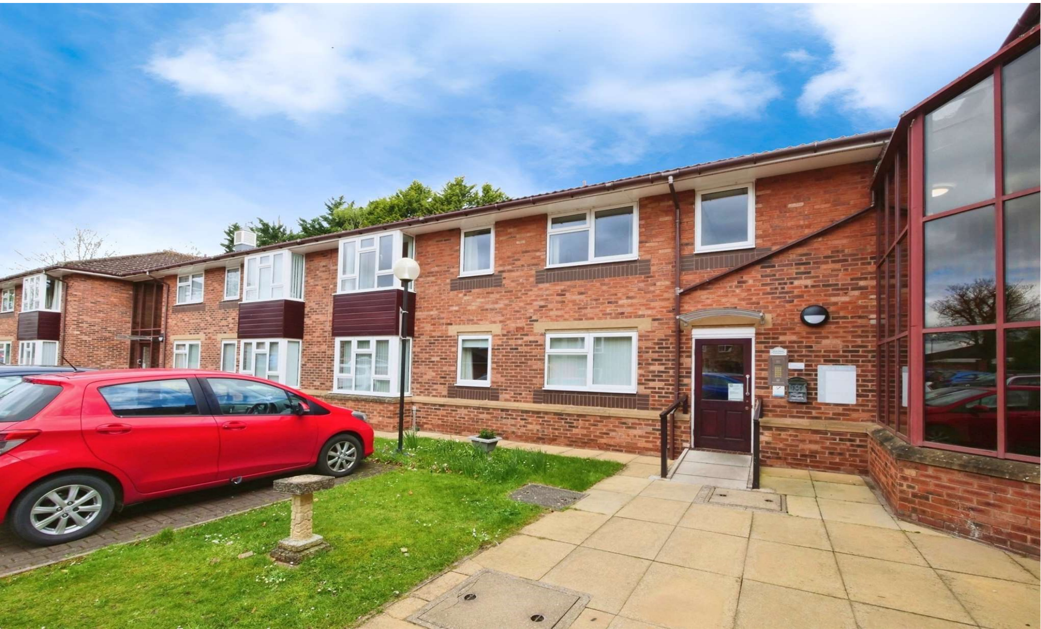
Wyre Mews, York YO32 2ZD