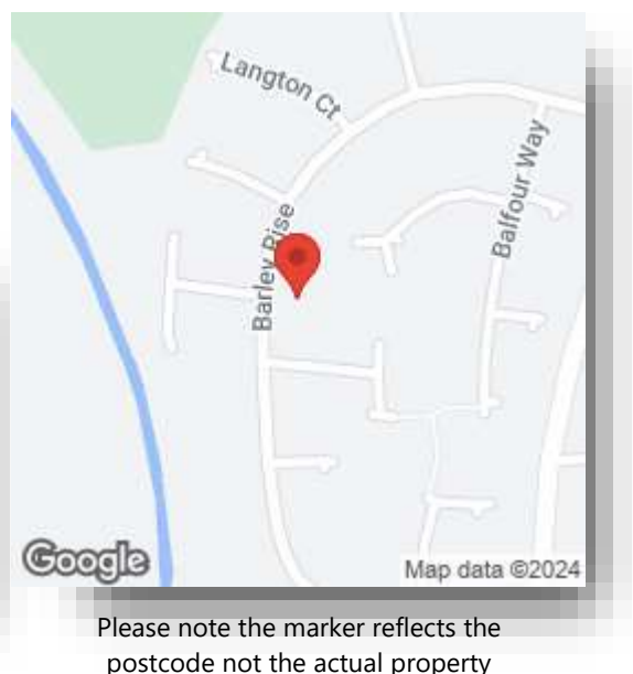
view this property online williamhbrown.co.uk/Property/HAX105018