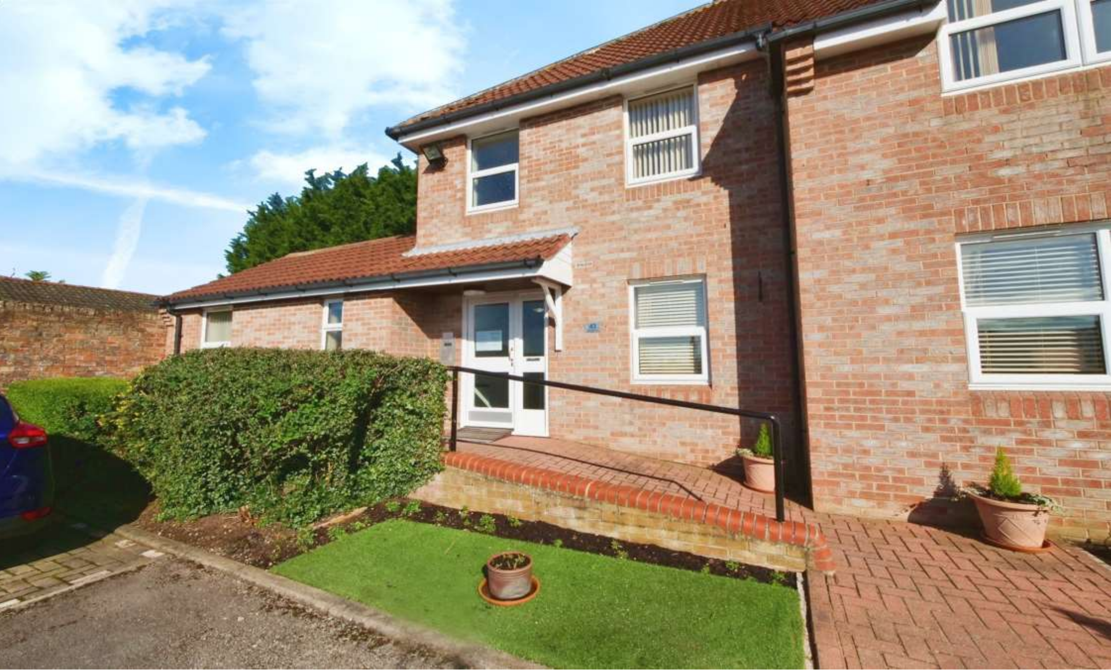
Ashgrove The Village, Haxby York YO32 2HY