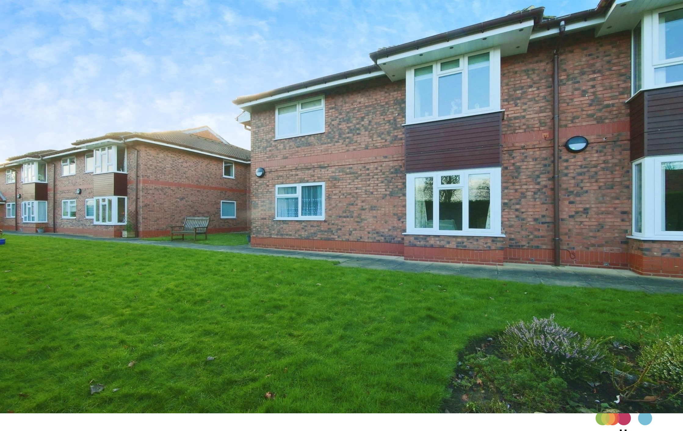
St Marys Mews, York YO32 2SE