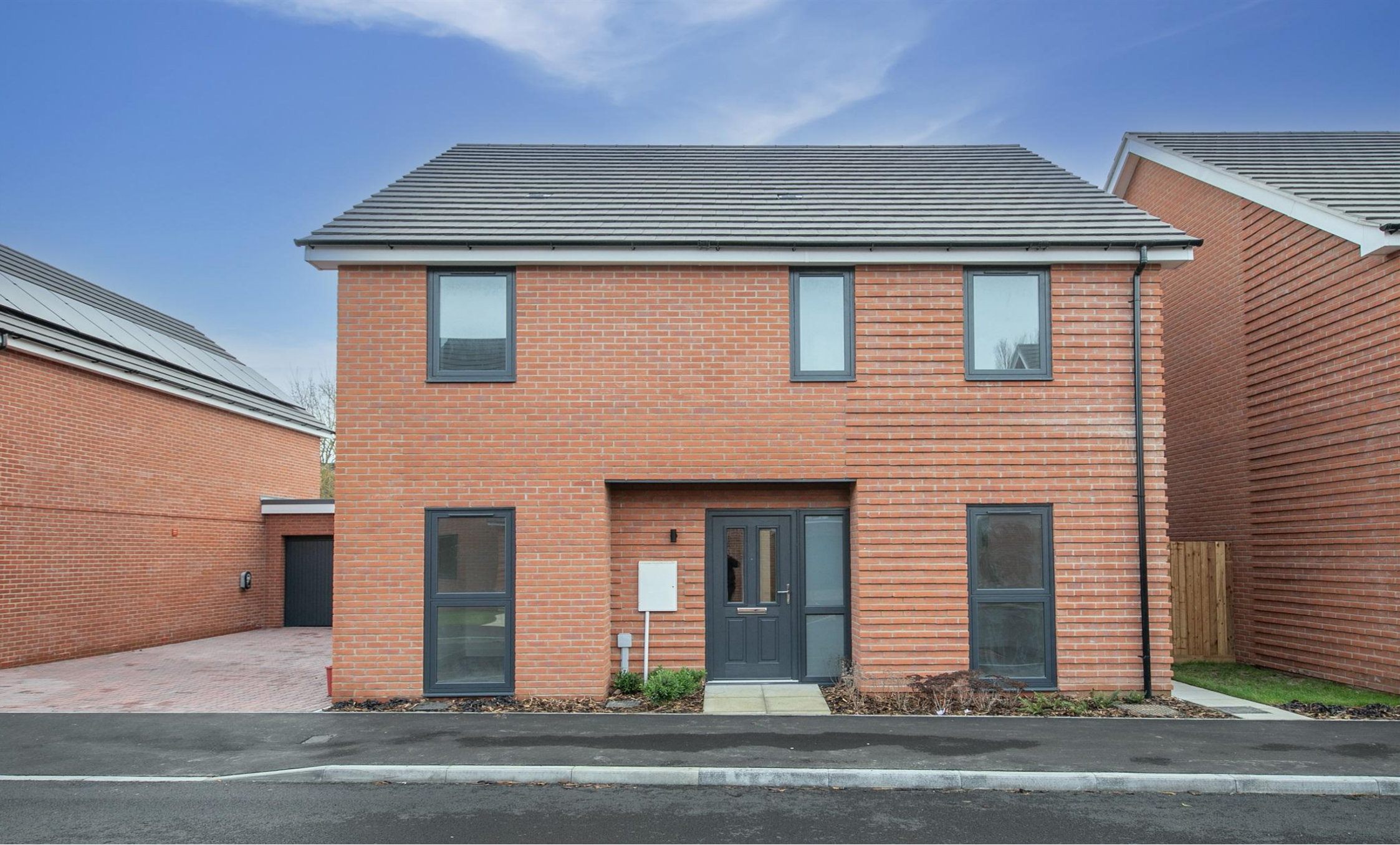
The Oak, The Paddocks, Ramsey Road, Ramsey, Harwich CO12 5EW